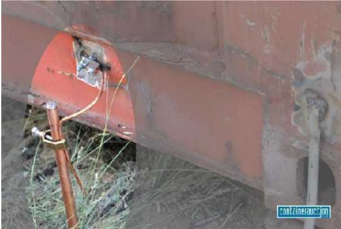
FIGURE 3: EARTHING ROD CONNECTED TO CONTAINER