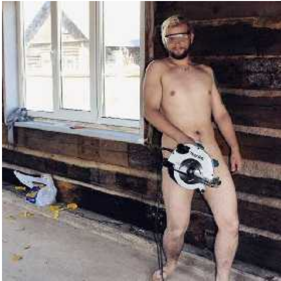
FIGURE 10: WHAT COULD POSSIBLY GO WRONG?

It will be hot, so you may be tempted to wear as few clothes as possible, but we would recommend keeping at least shorts, hat and a T-shirt on to avoid sunburn or burning yourself while welding, producing sparks or testing flame effects. Also, avoid loose clothing with strands and accessories hanging off it, and long hair must be tied out of the way.