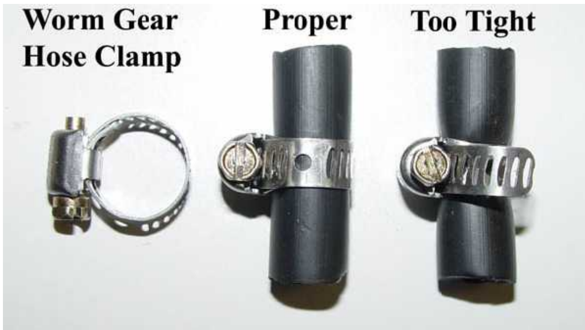
FIGURE 7 JUBILEE CLIPS

Jubilee clips (or Worm Gear clamps) can be used for low pressure gas for use in stoves but not for flame effects, where O-rings must be used. Do not over-tighten jubilee clips.