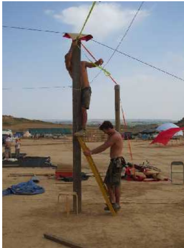
FIGURE 9: HOT DUDES ARE ESSENTIAL IN CONSTRUCTION, HOWEVER DO NOT USE A LADDER LIKE THIS!

Correct lifting sounds dull but, if you damage your back at the start of the festival, imagine how little fun the rest of it is going to be! See: