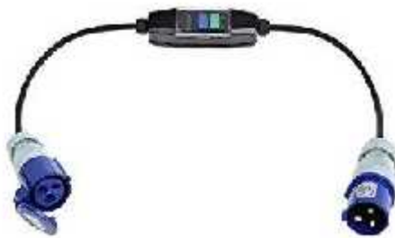
FIGURE 6: RESIDUAL CURRENT DETECTOR ON CEE FORM CABLES