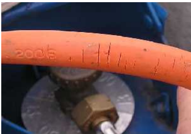
FIGURE 8 PERSIHED PIPES OR OLD PIPES WILL FAIL INSPECTION