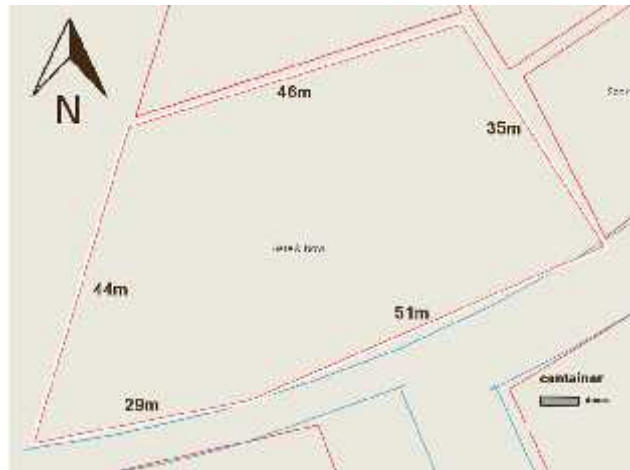
FIGURE 1: PLOT FROM NORG