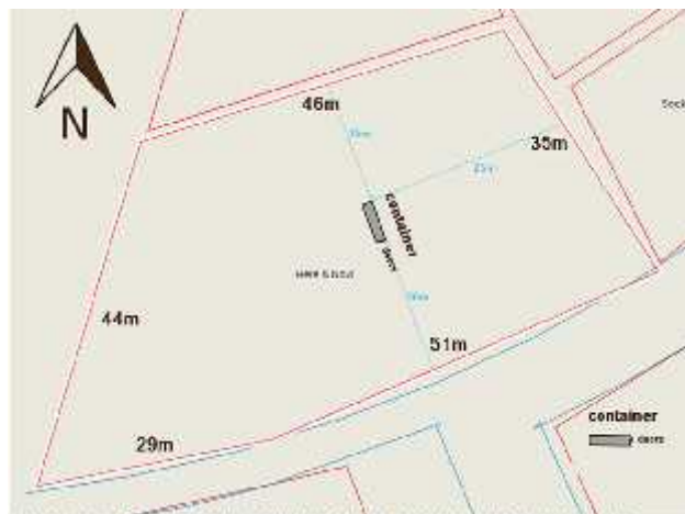
FIGURE 2 FIGURE RETURNED WITH CONTAINER CLEARLY MARKED ON IT