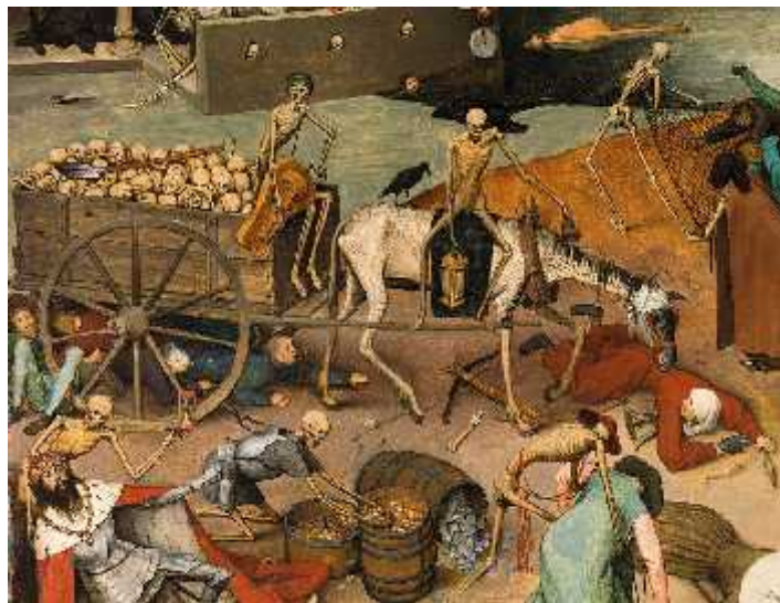
FIGURE 12: SUPER BARRIO BROTHERS 2013

Nowhere experienced a bad epidemic of dysentery one year. This placed a burden on the local health authorities and forced a review of health matters on site. We are keen to prevent this recurring.