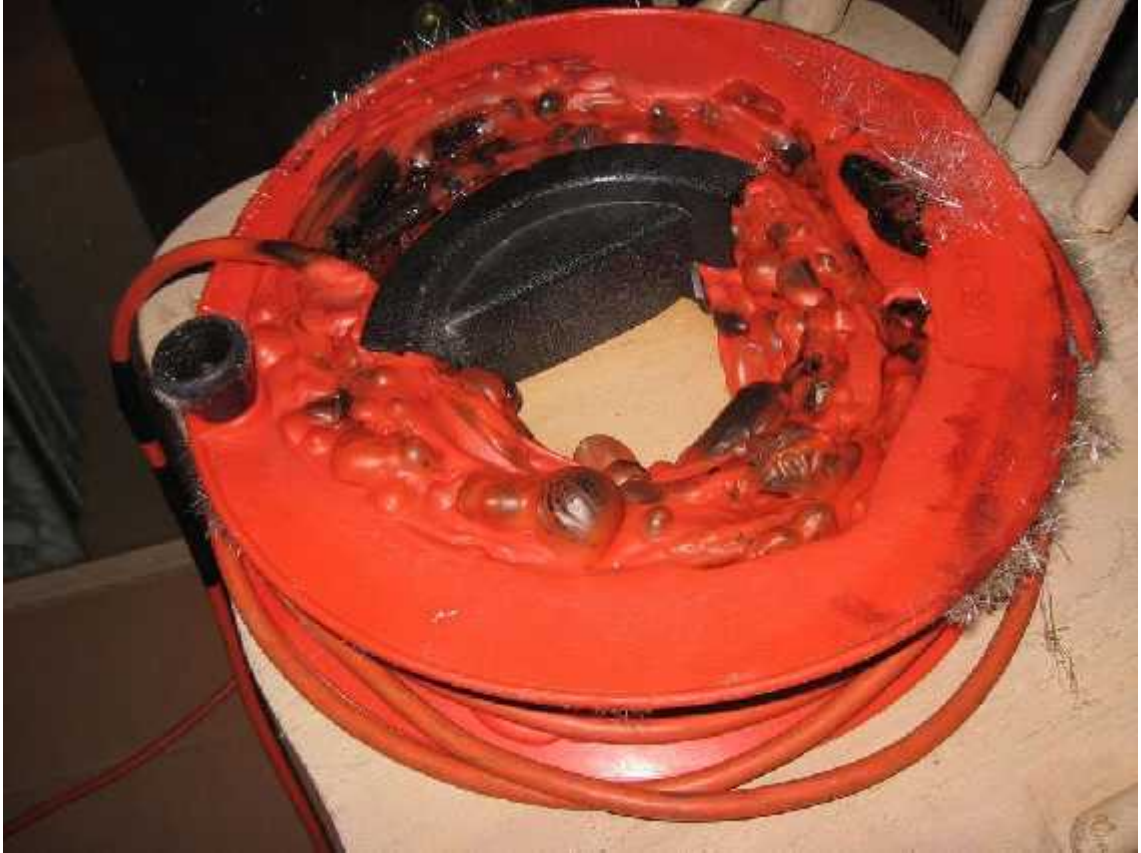
FIGURE 5: COILED WIRE WILL HEAT UP UNDER LOAD AND MAY CATCH FIRE