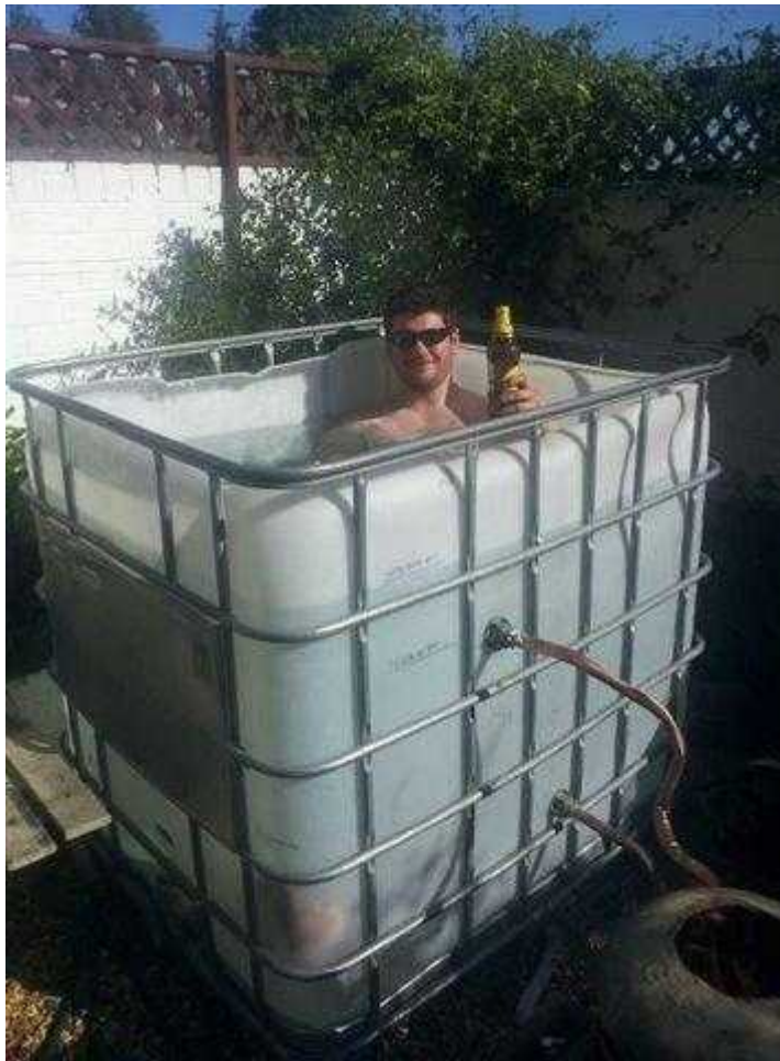
FIGURE 1: VERMIN MAY GET INTO YOUR CUBE.