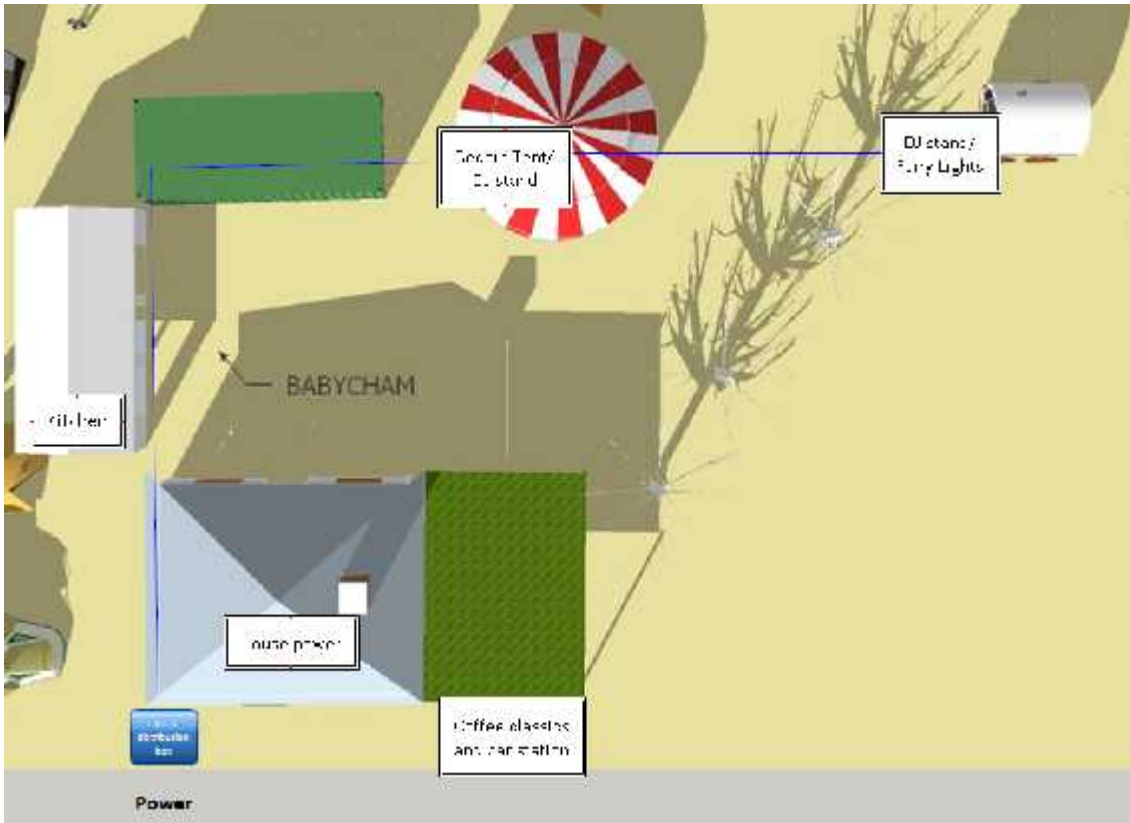
FIGURE 4: ELECTRICAL BACKBONE

These are designed to be used outdoors and can cope with getting wet (IP44 to you). There are two sizes, the smaller carries 16 Amps which is 3,840W. Any higher than that and you will need the larger sizes. Here's an example of an electrical layout plan: