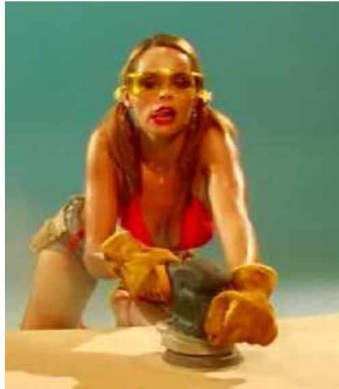
FIGURE 11: Q: WHAT IS WRONG HERE? A: HAIR NOT TIED BACK.