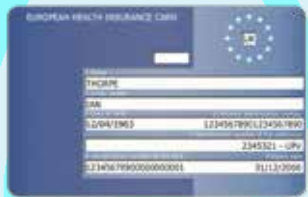
EU HEALTH INSURANCE CARD