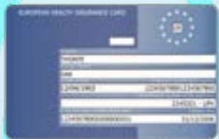
EU HEALTH INSURANCE CARD